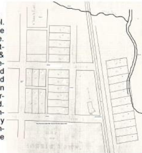
Original Plat Map of Morristown in 1850