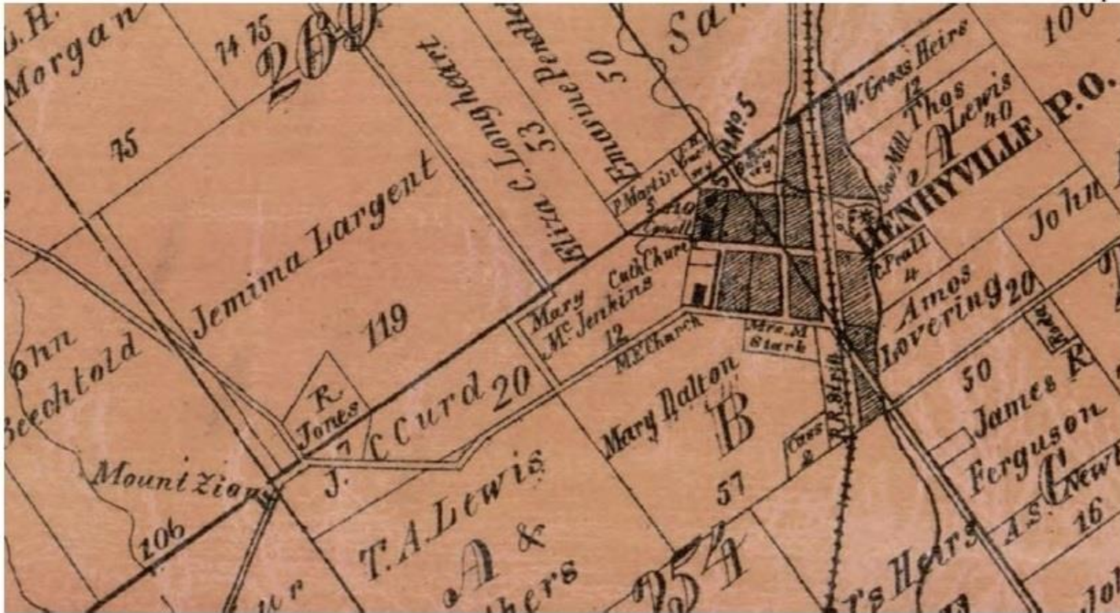
1875 Plat Map