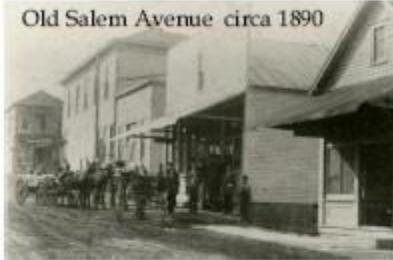
Old Salem Avenue circa 1890

Roads formed from Indian trails and along creeks. Several primary travel routes intersected around what was to become Henryville. A block house was located at the corner of Caney Road and CR160. It was also used as a stage coach stop. The Jeffersonville, Madison & Indianapolis Railroad, which brought on the development of Henryville, mostly follows an Indian trail.