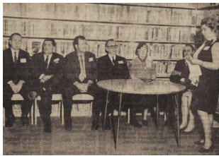
Ashland Daily Independent / Monday, March 23, 1970

As we celebrate GCPL's 50th anniversary, we will be highlighting historic facts each month in 2019.